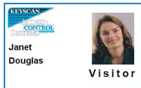
Visitor Badge Example